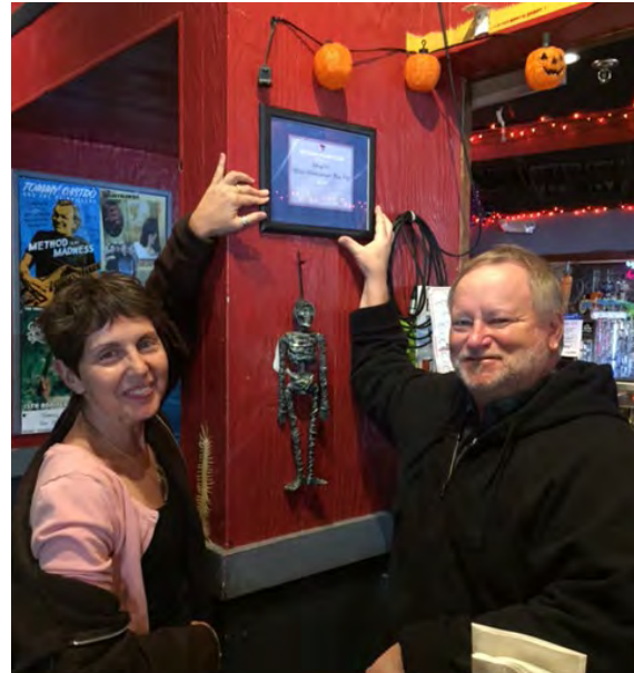
Johnny D's was given the Bisexual Resource Center's Bi Ally Award for hosting the mixed-gender bi brunches for so many years. They proudly displayed the award in their restaurant.