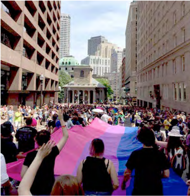
Bi contingent in Boston Pride 2015