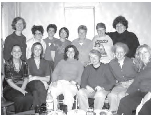
Bi brunch at Lucy's