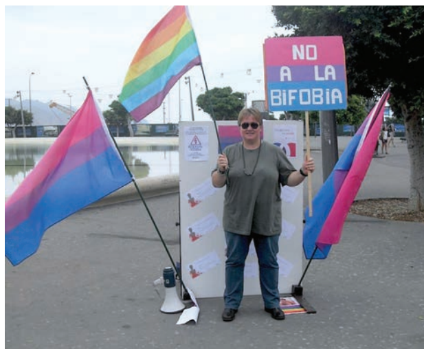
Bi visibility in the UK and in Spain